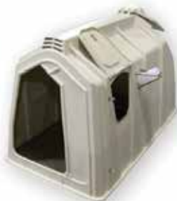
Calf-Tel Deluxe II • 220cm(L) x 122cm(W) x 136cm(H)