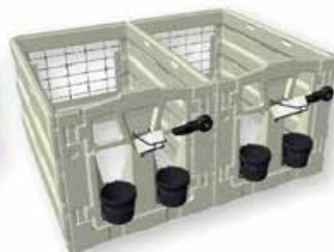
Calf-Tel Pen System • 122cm(L) x 183cm(W) x 114cm(H) or 122cm(L) x 214cm(W) x 114cm(H)