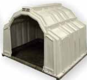
Calf-Tel Multi-Maxi Group House • 220cm(L) x 273cm(W) x 183cm(H)